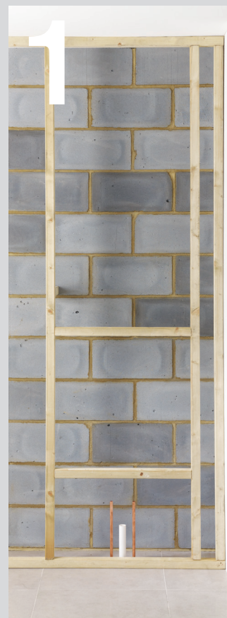
01 Install timber-frame (supplied by others).

The best value for function, finish and easy installation, Rapiduct's clever construction means it can be put together in the shortest time.