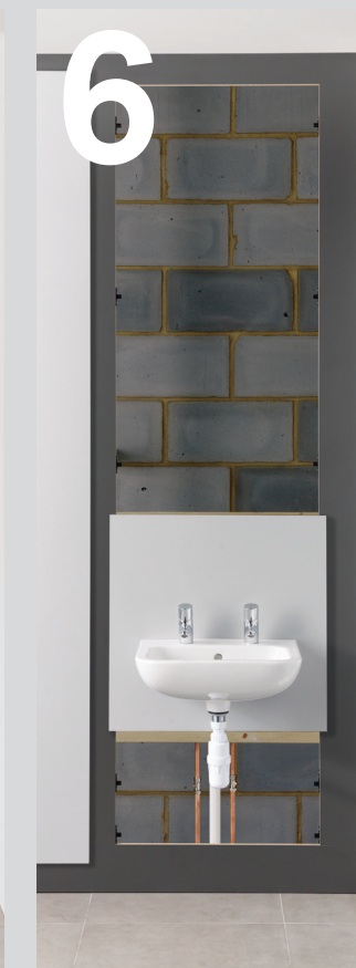
06 Once all the units are in position, connect the plumbing and services.