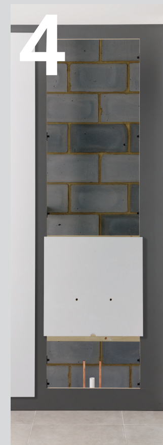
04 Drill or cut out for sanitaryware.