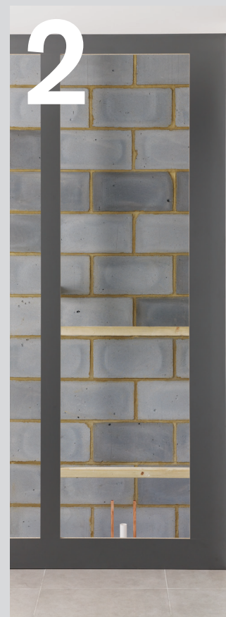
02 Fit base flashgaps to the site frame followed by vertical, horizontal and top flashgaps.