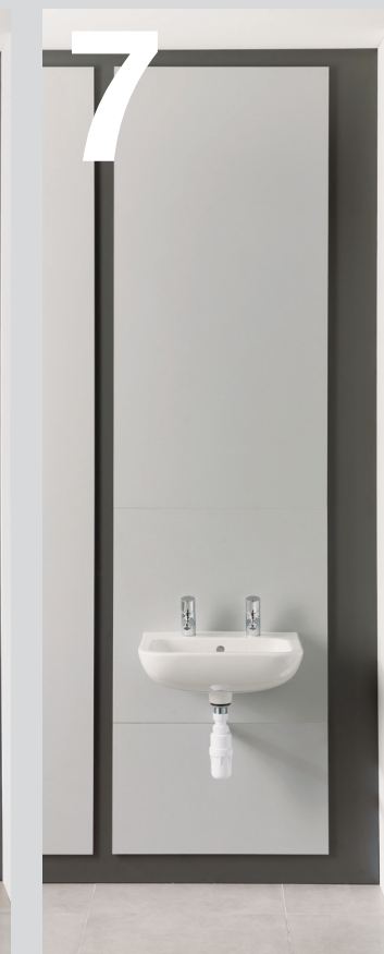
07 Simply attach the top and bottom panels to the units. Installation complete.